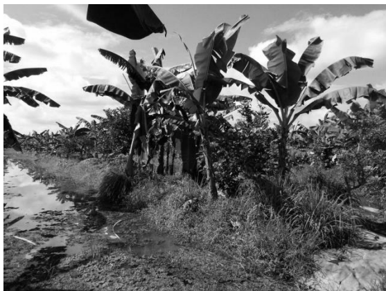
Figure 2. The Farmland in Lok Baintan Village

Women in the Floating Market also act as traders and farmers. They get the crops from their own farmland (Fig. 2) in the afternoon and then resold them in the floating market the next morning (Fig. 3). The main farm is managed by men. Women help their husbands to manage farmland. The woman's job is to harvest the crops for later selling at the floating market.