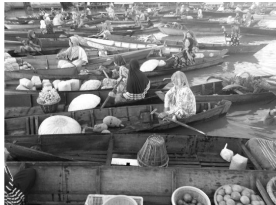
Figure 3. Women Trades Agriculture Product Using jukung

collected the day before they sell in the floating market.