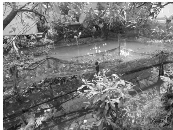
Figure 4. Fish Pond in Lok Baintan Village