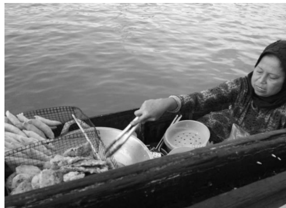
Figure 5. Traditional Cakes on Lok Baintan Floating Market

Women sell traditional cakes and traditional food by jukung (Fig. 5). Cuisine are made by traders or bought from traders in other traditional markets. Women have the role as the traders and food maker.