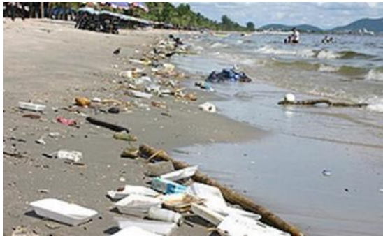
Figure 2. Waste on Bangsean beach as in daily situation

and the other parts will operate by the municipality employee. The operation time of waste management is since 05:00 until 16:30 to avoid disturbing the population and tourists activity.