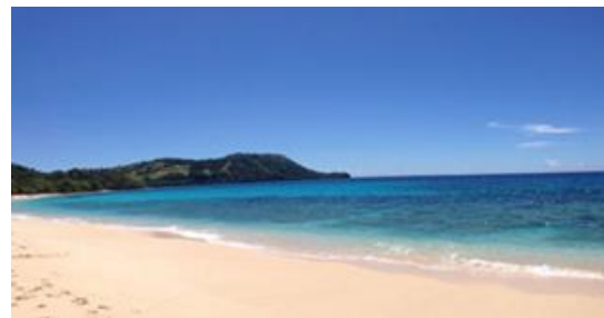
Figure 2. Pal Beach

Pal beach has a natural charm of underwater beauty of colorful coral and small fish in various forms to make Pal beach one of the attractions for tourists who have a hobby of diving. Besides, there is a Burung Cape round Pal beach. There are many government's plan for mangroves and the Marinsouw village to be developed; as mangrove tourism attractions that can support Pal beach.