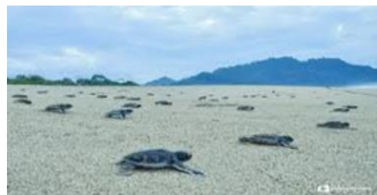
Figure 4. Turtle Hatchling at Pal Beach