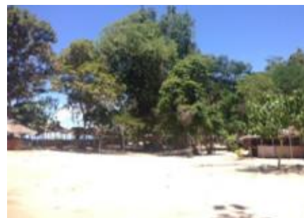
Figure 9. Parking Area in Pal Beach

Pal beach area has a spacious parking area so that the visitors do not need to wonder around to get a parking spot as shown in the Figure 9. In Pal coastal resort, there are a number of gazebo with three sizes: large, medium and small built by the government of North Minahasa Regency. This gazebo (Fig. 10), besides used as a family resting place, is also used for Christians worship places who do beach tourism worship. Gazebos for rent with various prices, as in Table 2.