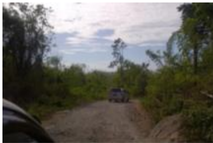
Figure 8. Access Road to Pal Beach

The entrance to Pal beach area is still inadequate, despite being paved with paving standards. But in a few months later, it is found a lot of broken asphalt resulting in holley and rocky road (Fig. 8). This is an obstacle for visitors who have a desire to enjoy the beauty of the Pal beach. Many visitors complained reasonably about access to the Pal beach which is 2.5 km from the village. During holiday season and national holidays, Pal beach is crowded causing long traffic jam when you enter Pal beach area. It is also the cause of the declining number of visitors who come to the Pal beach.