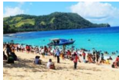
Figure 6. Pal Beach for Family Recreation

Aside from being a family recreation place, Pal beach also has water sport facilities such as banana boat and donut boat with the rental price of Rp. 25,000 per person. Visitors can take advantage of a banana boat and donut boat to tour around Pal beach for 30 minutes with a speed adapted to the demand of visitors as shown in Figure 7.