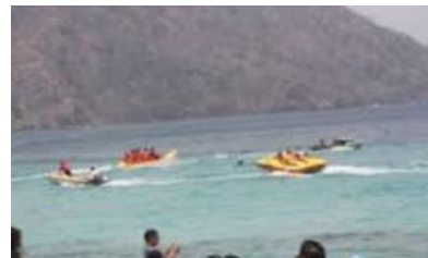
Figure 7. Water sport in Pal Beach