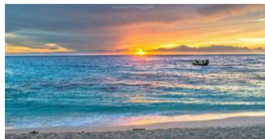
Figure 3. Sunrise at Pal Beach