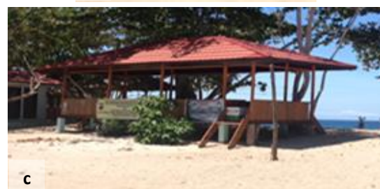
Figure 10. Gazebo in Pal Beach. a) small gazebo, b) medium gazebo, c) large gazebo. (source: personal documentation)